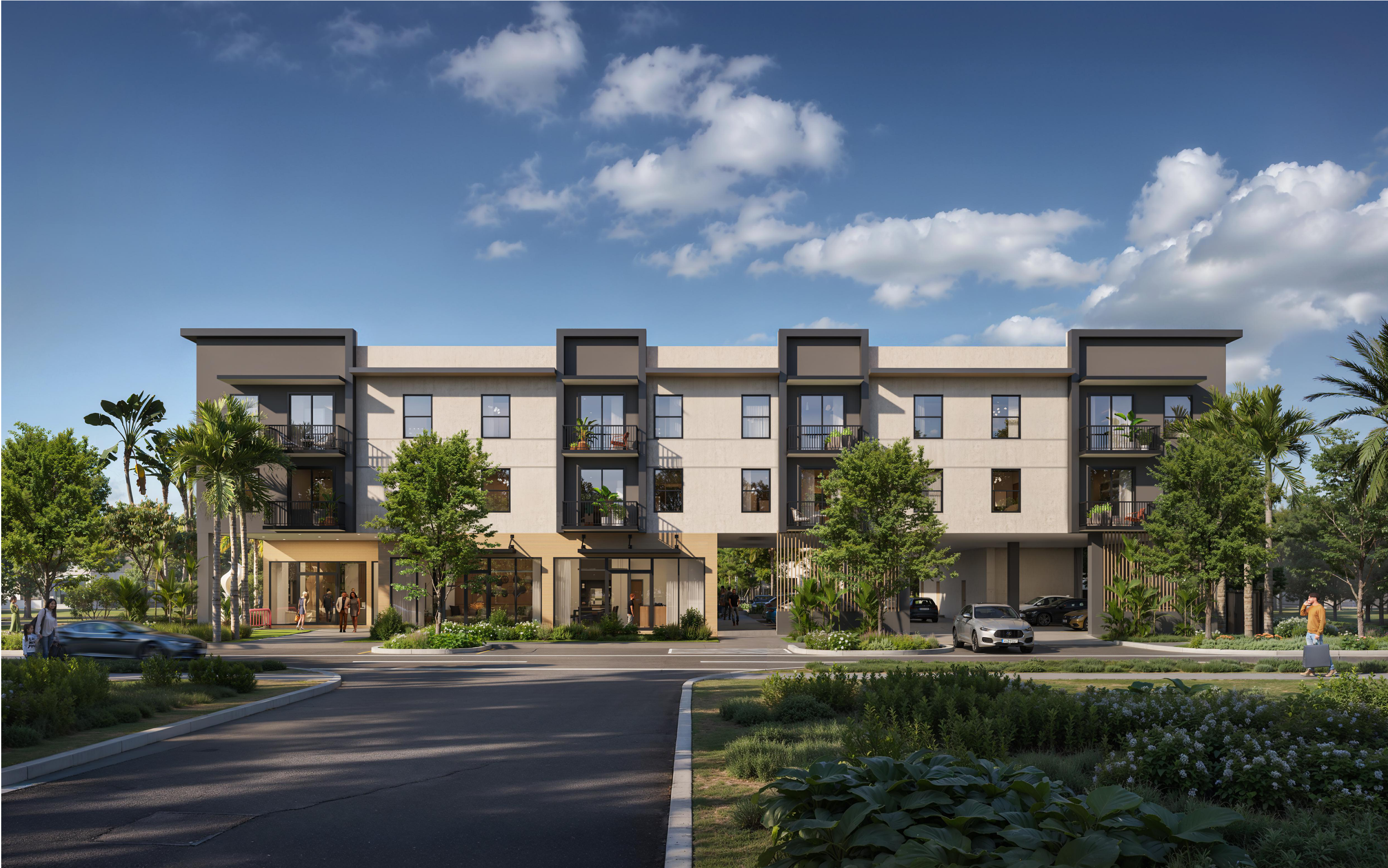
3D RENDERING - NORTH VIEW (FRONTAGE ELEVATION NW 6TH STREET)